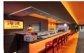
Kaito Sushi Bar