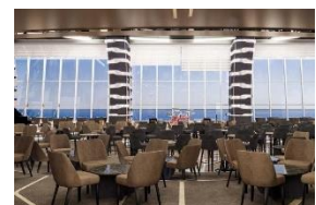
Carousel Bar & Lounge