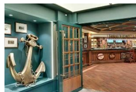
Master Of the Seas