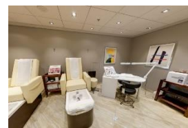
Manicure / Pedicure