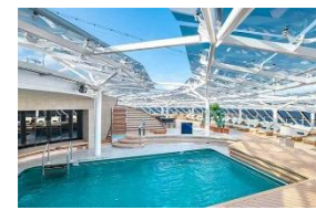
Sun Deck & Bar