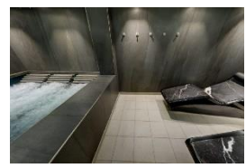
Jacuzzi & Relax Area