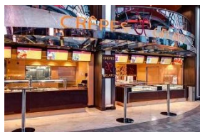
Jean Phillippe Crepes