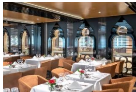
Il Campo Rest.

In addition to the restaurants and cafeterias, the ship also has 21 bars, pubs and lounges that offer a wide range of food and drink options, from healthy fresh smoothies to cocktails made to order.