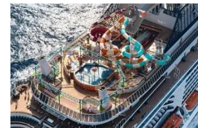
Coral Reef Aquapark