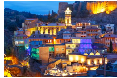
Old Tbilisi Downtown