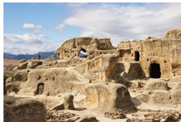
Uplistsikhe Rock Town