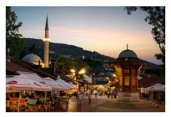
Main Square in Sarajevo

Bosnia is a country on the Balkan peninsula in Eastern Europe. It is characterized by a great mixture of eastern-oriental tradition and western values, making the country one of the most interesting destinations in Europe. Below are some photos that do not really do justice to this amazing destination.