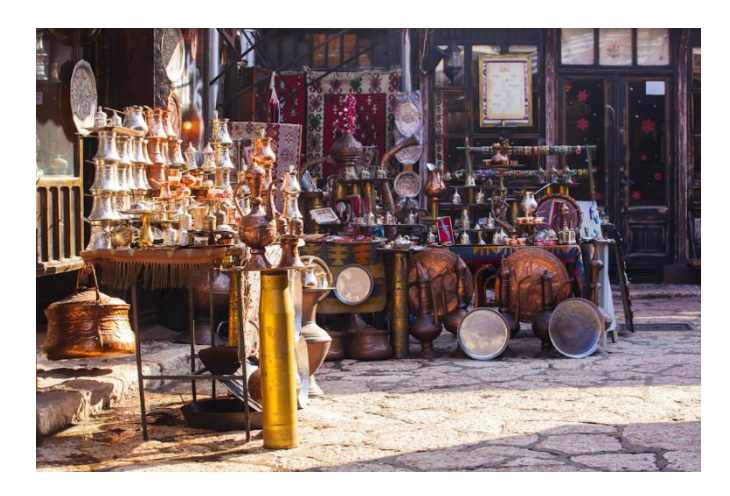
Street shop in Bas Carsija market