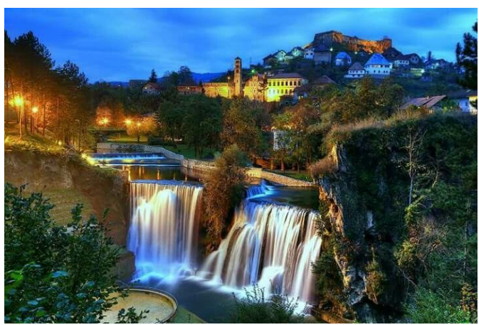
Waterfall in town of Jajce