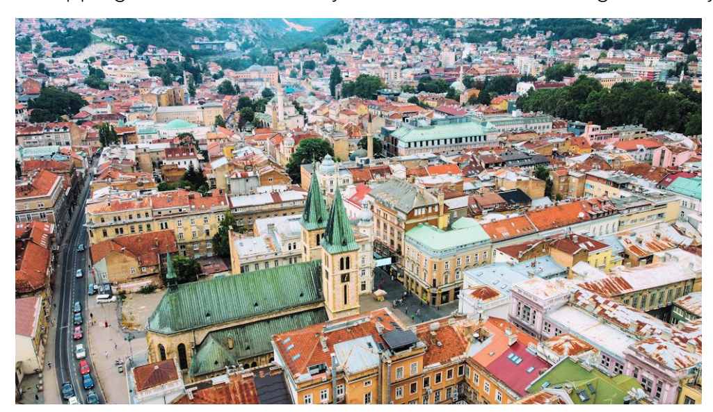
Sarajevo - Old Town, aerial views

After breakfast, sightseeing of Sarajevo, the beautiful Ottoman-style mosques and architecture, the old quarters still maintain an authentic Ottoman carsija with oriental sweet shops, cafes, and traditional Bosnian food. During this sightseeing, the group will be followed by our guide who will provide them with detailed explanations and the meaning of the most famous religious, cultural, historical and economic monuments in Sarajevo such as: The Old City Hall, Old handcrafts street, Gazi Husrev bey's mosque, Clock Tower, Gazi Husrev bey's mausoleums (turbe), Kursumlija Madrasah, Emperor mosque, Latin Bridge, free time for shopping before we transfer you back to hotel. Overnight in Sarajevo.