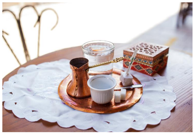
Traditional Bosnian coffee