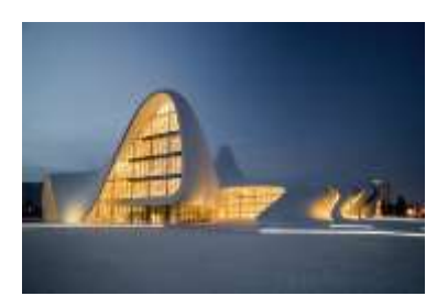
Heydar Aliyev Centre

Perun Tours Rasis Business Center Bldg. 3rd Floor, Office No. 93 Al Barsha, Dubai, UAE www.peruntours.com