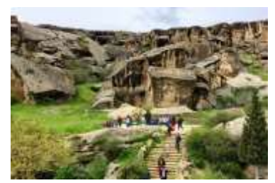
Gobustan National Park